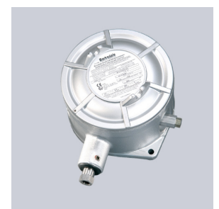
Explosion Proof Bourdon Tube