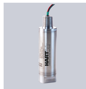
Explosion Proof Intelligent Transmitter