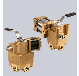
Heavy Duty Valves