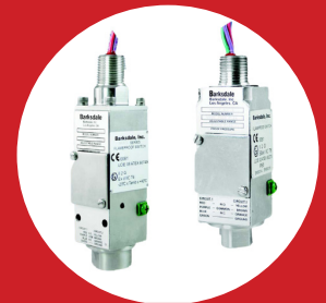
Explosion Proof Compact Switch