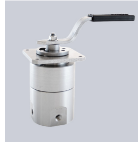
High Pressure Valves